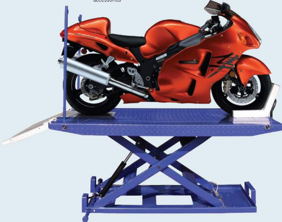
M-1500C-HR Motorcycle lift shown with standard accessories

These lift tables are ideal for making repairs to motorcycles, snowmobiles, ATVs, jet skis, etc. Choose from a range of accessories to customize these tables for your shop.